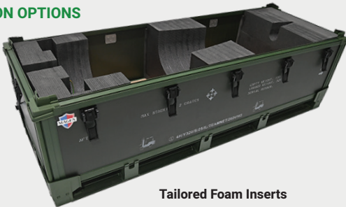
Tailored Foam Inserts