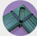
Anti-Slip Rubber-Tipped Legs